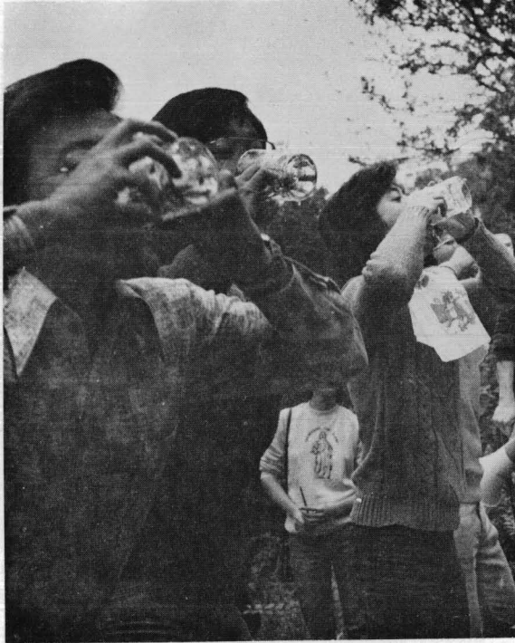
A napkin for the baby.