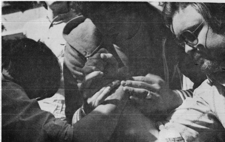
A knock-out from the start.